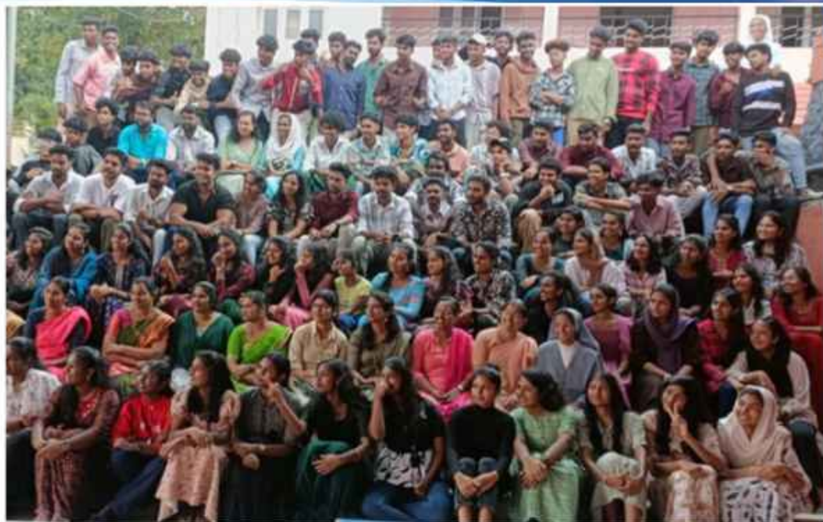
Past Pupils Meet