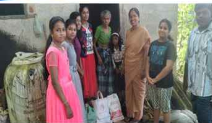
NCP's Onam Kit to the poor families